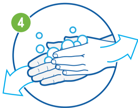
Rub hands palm to palm.