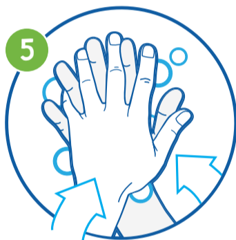
Rub hands palm to palm with fingers interlaced.