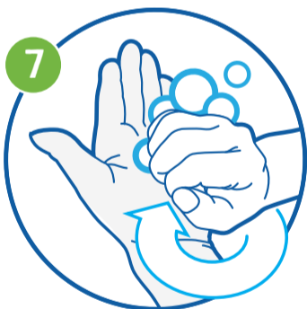
In a circular motion rub the tips of fingers in the palm of the opposite hand.