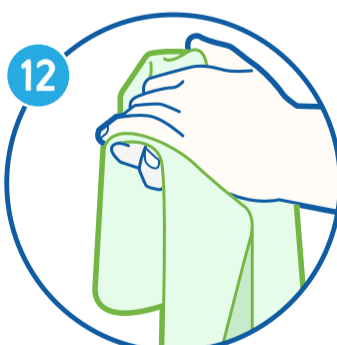
Dry hands with clean paper towel and use paper towel to turn off tap.

Researchers think that if everyone washed their hands properly, about 1 million lives would be saved every year. 1