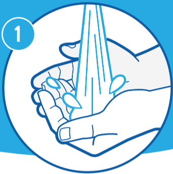
Wet hands with water.