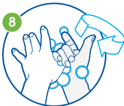
Clean thumb by holding it in the other hand and rotating.