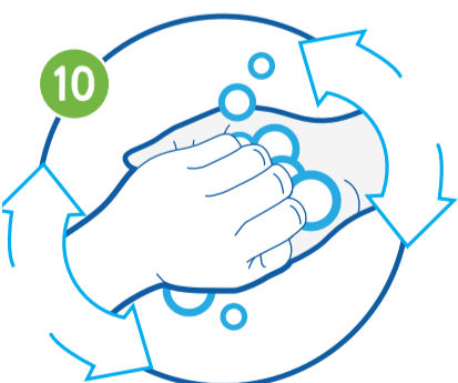
Interlock fingers and rub back of fingers on opposite palms.