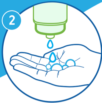
Apply enough soap to cover all hand surfaces.