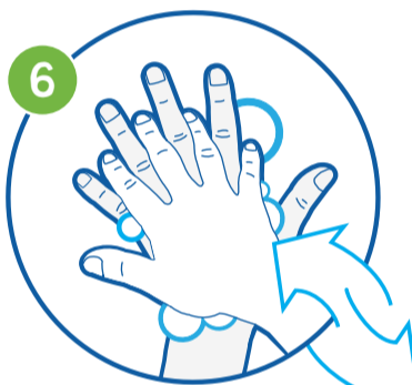
Rub back of hand using the palm of the other with fingers interlaced