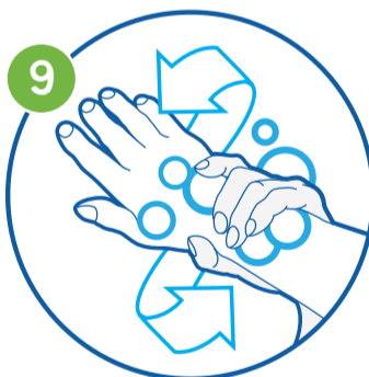
Rub wrist with the opposite hand.